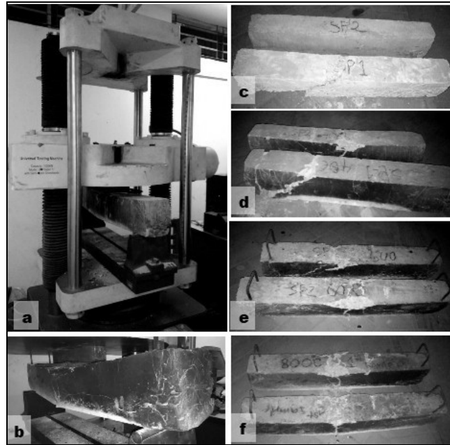
Figure 3: a) UTM setup for Bending test, b) Typical beam at bending, c) Un burnt beams, d) Beams burnt at 400°C, e) Beams burnt at 600°C, and f) Beams burnt at 800°C.

To obtain pure flexural failure, two point load testing was carried out. All the beam specimens were cured in a curing tank for 28 days & then tested. Two unburnt reference specimens were tested for the flexural strength using UTM and the results was recorded. The burnt beams were tested in the same way. The load was increased gradually till the failure occurred in a typical fashion. The loads on appearance of flexure and shear crack along with the failure load were recorded. Figure 3 shows the setup for bending test in an UTM along with the samples after tests. Details of beam reinforcement and loading is shown elsewhere (Apu et al, 2014).