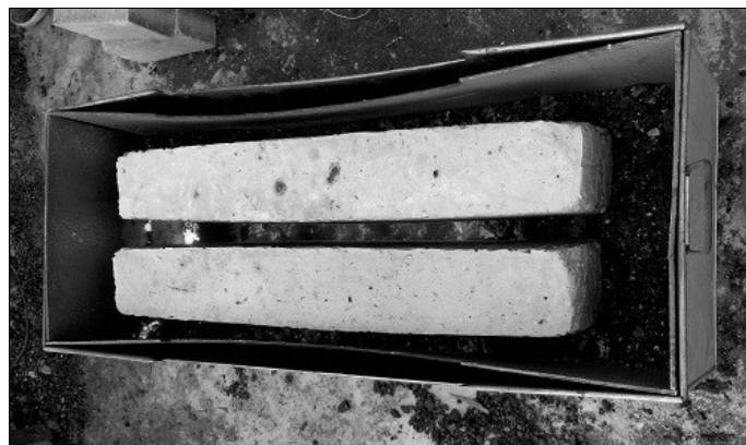
Figure 2: Burning of beam inside the furnace

The beams were burnt inside the furnace constructed. Two types of coal, wood coal and stone coal of ratio 2:1 respectively were used for burning. A sand layer having 0.5" thick was placed on the bottom of the shell to restrict the heat transmission. Then approximately 2.5" layer of coal was placed on the sand layer. Continuous air blow was applied to keep the coals burning and to attain and control desired temperature level. The beams were placed inside the shell over two fire clay bricks, and the coal around the beams were burnt. Two beams were