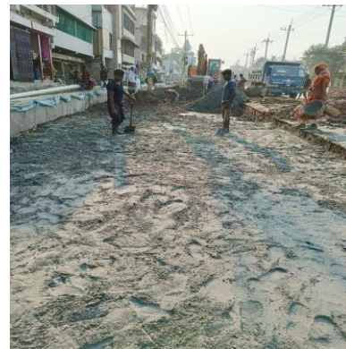
Figure 2(b): Improved subgrade or sand filling work

Base course preparation: The base course layer is completed after the subbase course layer is completed. Brick chips or stone chips make up 80% to 90% of the base course. Base course is often utilized on flexible pavement; however, it is also employed on rigid pavement with high wheel loads in rare circumstances. In the case of flexible pavement, the base course is normally located under the surface course, and in the case of rigid pavement, it is located beneath the RCC road surface. The base course's minimum CBR value is 80%. The base course surface should be compacted again if the CBR value is less than 80%. Depending on the road design, base course layer thickness is given around 100 mm to 300 mm in thickness. If the thickness of this layer is greater, 100 mm to 150 mm layers are rolled though a heavy weight roller at layer by layer for proper compaction, with the maximum size of brick or stone chips remaining at 38 mm. Figure 3(b) illustrates that the Base course preparation work at road construction site.