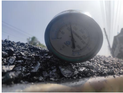
Figure 5(b): Temperature check of bituminous materials