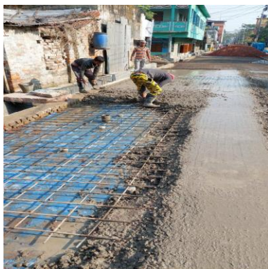
Figure 4(a): RCC road casting

Final finishing and maintenance: After the casting is completed, the top surface of the road is grouted using a cement sand and water mixture if the finishing on the CC or RCC surface is not satisfactory. Regular water curing should be carried out for at least 28 days following the casting of the road. Additionally, it's important to make sure that no cars are driving during this period to avoid the road's eventual strength being compromised. Figure 4(b) illustrates the curing process of completed road