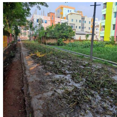
Figure 4(b): Curing of completed road

Preparation of Flexible pavement: When the base course is ready in accordance with the design, at this point the carpeting construction gets underway. Prime coat is applied to the base course one day before to the commencement of carpeting installation to ensure that the road bed is dust-free and waterproof and that existing brick or stone chips are well bonded. This strengthens the base course's adhesion to the bituminous layer. On the next day following prime coating, carpeting