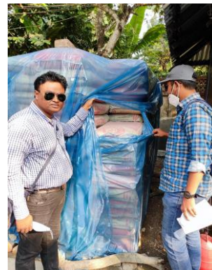
Figure 1(b): Stocked material check in the site