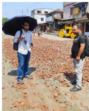
Figure 3(a): Subbase work at road construction site

Base course preparation: The base course layer is completed after the subbase course layer is completed. Brick chips or stone chips make up 80% to 90% of the base course. Base course is often utilized on flexible pavement; however, it is also employed on rigid pavement with high wheel loads in rare circumstances. In the case of flexible pavement, the base course is normally located under the surface course, and in the case of rigid pavement, it is located beneath the RCC road surface. The base course's minimum CBR value is 80%. The base course surface should be compacted again if the CBR value is less than 80%. Depending on the road design, base course layer thickness is given around 100 mm to 300 mm in thickness. If the thickness of this layer is greater, 100 mm to 150 mm layers are rolled though a heavy weight roller at layer by layer for proper compaction, with the maximum size of brick or stone chips remaining at 38 mm. Figure 3(b) illustrates that the Base course preparation work at road construction site.