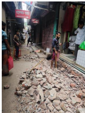
Figure 1(a): Land acquisition for road construction

Layout of the site: The contractor brings and stores construction supplies including sand, brick, and cement at the site after determining the region that has been set aside for road construction. The contractor receives preliminary instructions to begin construction, known as layout, after the official and on-site engineer inspect the materials. Figure 1(b) illustrates the checking of materials stocked in the site before starting the work.