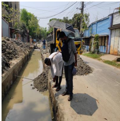
Figure 2(a): Earth excavation work on site

Subbase preparation: Improved subgrade, i.e. sand filling is completed, and the layer becomes the subbase layer. Sub-base is typically made with a 1:1 mixture of sand and brick or stone chips. It is often produced in thicknesses ranging from 100 mm to 300 mm at times. In this situation, it should be noted that the size of the brick chips should not exceed 38 mm, otherwise, the compaction requirement will not be met. For compaction, a required amount of roller should be given and it should ensure the mixing ratio of subbase is 1:1 of sand and gravel otherwise compaction may not meet the required. After this layer's job is done, the CBR value is tested using the DCP test to check if it meets the compaction criteria. The subbase course has a minimum CBR value of 30%. Compaction should be repeated if the CBR Value is less than 30%. Otherwise, load transfers would be ineffective, and road settling will occur, which is one of the causes of road surface deterioration. In both situations of road building, rigid pavement and flexible pavement serve as the sub-base. Figure 3(a) illustrates that the subbase preparation work at road construction site.