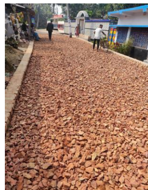
Figure 3(b): Base course work at road construction site