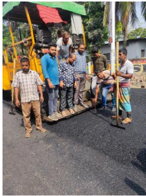
Figure 5(a): Bituminous carpeting work by paver machine

installation begins. The components of the asphalt surface layer include gravel, pick gravel, coarse sand, and bitumen. The ratio specified in the asphalt design is followed while mixing. Afterwards, a paver machine is used to install it on the base course bed that has been prepared. The complexion is then guaranteed by rolling as necessary. If new carpeting work is installed over an old carpeting bed, make sure the old bed is well cleaned before applying a tack coat. Tack coat provide a good bonding with existing bituminous road. Before asphalt is placed on the road bed, its temperature must be monitored. The asphalt material should be between 130 and 150 degrees celsius before it is placed on the road bed. Additionally, the minimum rolling temperature is 85 degrees celsius. This means that compaction should be done with a roller between 85 and 100 degrees celsius, or before the asphalt material's temperature drops below 85 degrees. Figure 5(a) shows that the construction phase of flexible pavement by paver machine and Figure 5(b) shows that the temperature check of bituminous materials on site.