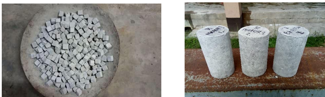
Figure 2: Artificial Aggregate and Concrete Incorporated with Artificial Aggregate

Cylindrical specimens (Diameter 4" & Height 8") were made to determine the compressive strength of concrete. Concrete was made incorporated with both Artificial aggregate and Natural aggregate (stone chips). For both types of specimen, curing period was 7 days and 28 days. After curing, compressive strength of both type of cylindrical specimen was determined and then comparison of compressive strength of concrete was done. Compressive strength of cylindrical concrete specimens was conducted according to ASTM C39.