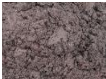
Figure 1: Mixed ingredients of leather shaving dust, cow dung and chicken manure

Figure 1 shows a mixed ingredient of composting material. The leather shaving dust (LSD), cow dung (CD) and chicken manure (CM) were mixed manually with a distinct ratio to maintain the carbon to nitrogen ratio (C/N=25-30:1) between 25-30 composting. Table 2 shows the amount of the LSD, cow CD and CM for each pile.