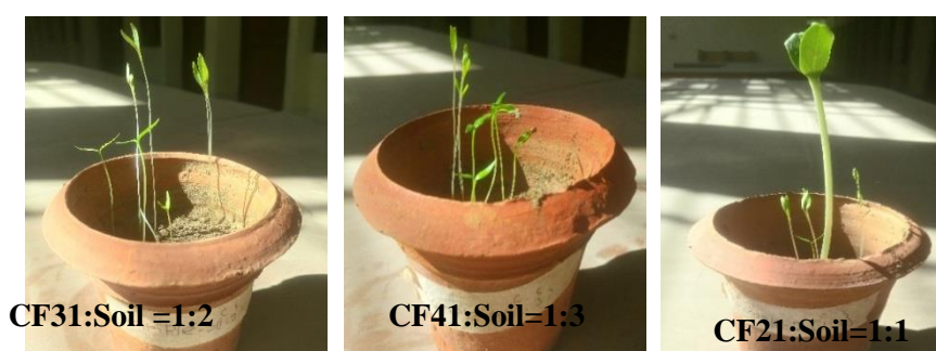
Figure 3: Germination test by sowing pepper seeds and gourd seeds

The suitability test of compost for agricultural purposes was carried out by germination of pepper seeds and gourd seeds. Among the compost samples, CF31 (CF:Soil=1:2) and CF41 (CF:Soil=1:3) have better germination as the significant growth of pepper plant which is shown in the Figure 3 as the NPKS content of those samples are comparatively higher than other samples i.e. CF11 (N=2.3%, P=2.0%, K=0.6% and S=0.9%) and CF21 (N=2.1%, P=2.2%, K=0.8% and S=1.0%). After 2 weeks of observation, the sample CF31: Soil=1:2 has better plant height but was not so much nourished.