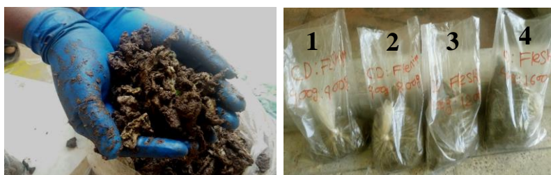
Figure 1: Sample preparation using limed fleshing and cowdung

After the collection of limed fleshings, it was chopped into very small pieces and mixed with cow dung in anaerobic condition with the different ratio which is shown in Table 1.