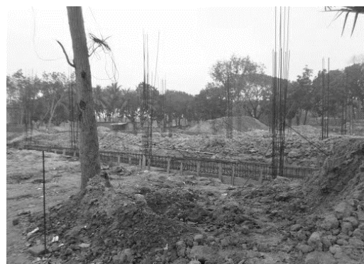
Figure 2: Site construction image of TSC-KUET

The project plan of the TSC building foundation work has the various activities that would be carried out, as well as the duration (days) and cost of each activity in KUET area. The activities included planning, procurement of materials, excavation, plumbing and so on. The data contains the level of precedence among various activities, as well as the cost of each activity. To prevent clumsy analysis, activities were grouped.