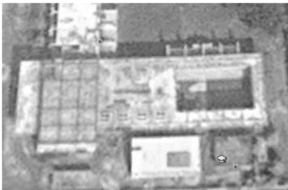
Figure 1: Location of TSC from google earth

“TSC-building-KUET” (Figure 1&2) which is situated in besides KUET auditorium in Teligati, PhulBari Gate was selected as our study area. This building consists of 4-block. Block –A was selected for analysis. It is two storied building. Specifically we work with foundation portion (Figure 2) illustrate this.